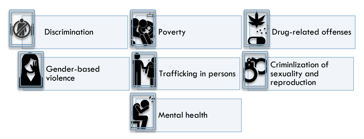
Figure 1: Leading factors to women imprisonment UNDOC Toolkit on Gender-responsive Non-custodial Measures (2020)

Pathways for women typically include a combination of gender-based violence, substance use disorders, mental illness, and poverty. The UNODC Toolkit on Gender-Responsive Non-Custodial Measures cites the driving factors behind women imprisonment globally as including discrimination, poverty, drug-related offenses, gender-based violence against women, trafficking in persons, criminalization of sexuality and reproduction, and mental health. Further, the toolkit emphasizes the economic and social cost of imprisonment for women during pretrial detention.