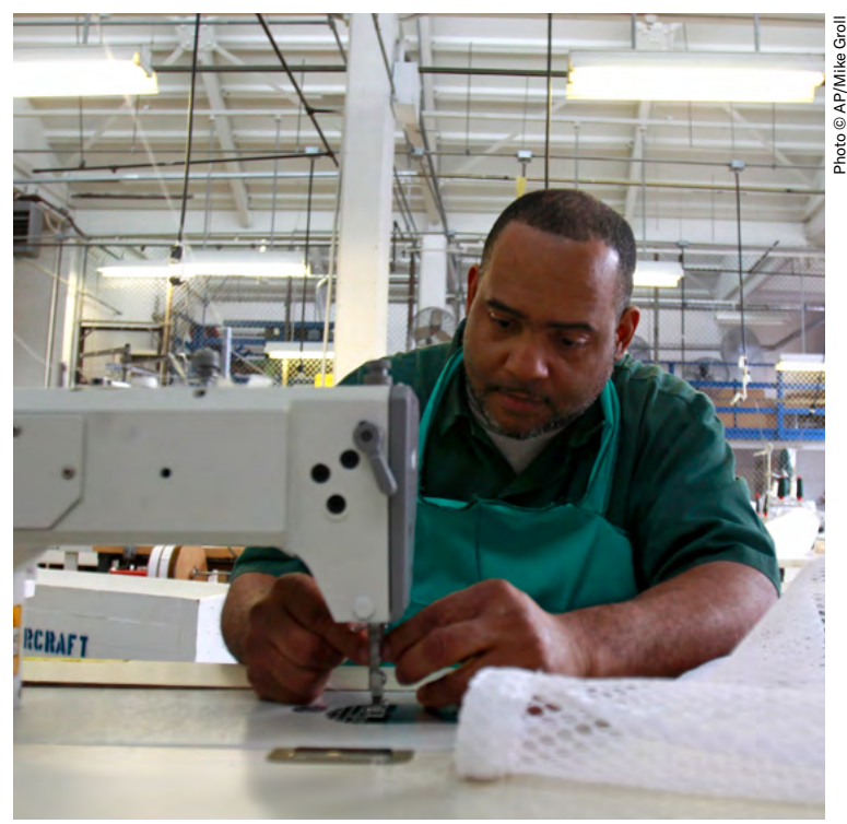
An incarcerated worker sews a laundry bag while working in a garment shop at Coxsackie Correctional Facility in New York.

A worker incarcerated in Chicago said he was surprised when his superiors at a prison food facility quickly put him to work with only minimal training. Not long after, he lost several of his fingers on a deli slicer.<sup>574</sup> At a trial concerning the incident, he explained that he never received an orientation session or even an explanation of the facility's rules or safety precautions. Nevertheless, he was