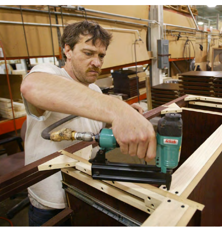
An incarcerated worker assembles office desks at Turney Center Prison and Farm in Only, Tennessee.