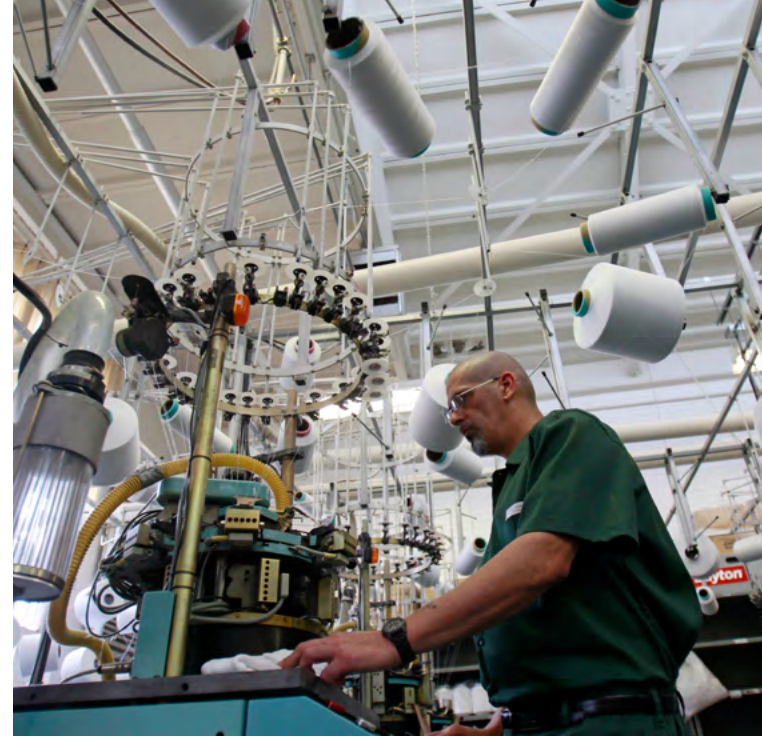
An incarcerated worker operates a sock-making machine in a garment shop at Coxsackie Correctional Facility in Coxsackie, New York.

to afford basic necessities with their prison labor wages.<sup>694</sup> This often means that families must step in. Most state prison systems ban or severely limit care packages from families to supply necessities; instead, families are required to go through prison commissaries and private vendors that offer care package programs.<sup>695</sup> One study estimates that families with an incarcerated loved one, many of whom are impoverished themselves, spend $2.9 billion a year on commissary accounts and phone calls.<sup>696</sup> Over half of these families are forced to go into debt to afford a relative's conviction and subsequent incarceration.<sup>697</sup>