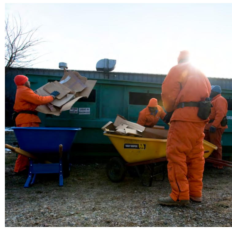
Incarcerated workers carry loads of cardboard to recycling bins at Camp Waterloo, a deteriorating former state prison. Prison work crews cleared trash and scrap metal from the abandoned prison facility in Waterloo, Michigan.

Only 7.3 percent of survey respondents reported working in state and private prison industries, goods production, and contract services jobs that