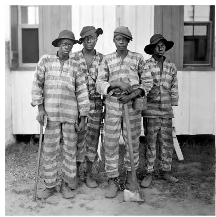
A Southern chain gang, photo taken between 1900 and 1906.

In the North, incarcerated people were contracted out to private individuals and entities to perform labor in industrial factories.<sup>182</sup> Under this contract system, incarcerated laborers were often forced to work 14 to 16 hours a day and were brutally punished for not working fast enough, for accidentally damaging equipment, and sometimes for no reason at all.<sup>183</sup> These severe punishments, which included hoisting incarcerated individuals "up by the thumbs with fishing line and a pulley mechanism attached to the ceiling,"184 allowed Northern states to produce in one year alone what, in today's dollars, amounts to over $30 billion worth of prison-made goods.<sup>185</sup> By the late 1800s, over 75 percent of the North's incarcerated population worked in these factories. This economic exploitation fell largely upon impoverished, immigrant, and African American communities who