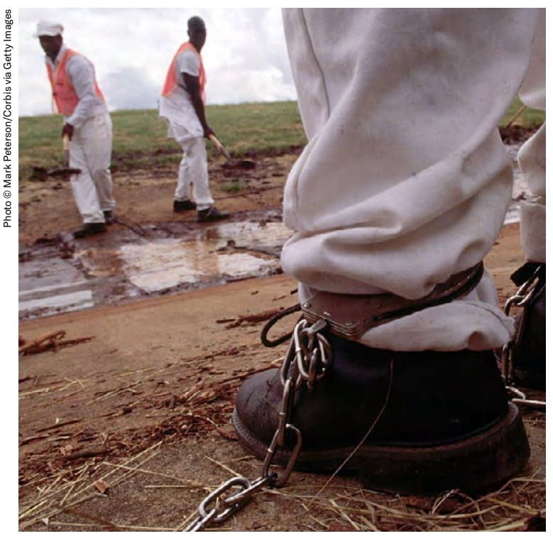
Shackled incarcerated workers from the Limestone Correctional Facility on a chain gang doing roadwork in Huntsville, Alabama, in August 1995.

This section focuses on coercion through the threat of punishment —such as solitary confinement and loss of family visitation—to prevent incarcerated workers from challenging the arbitrary and discriminatory nature of their work assignments. The second form of coercion, discussed in greater detail in the section of this report titled "Captive Market," involves coercion through deprivation —whereby incarcerated people work because it is the only way for them to pay for basic necessities, or because it is the only alternative to being confined in their cells.<sup>400</sup>