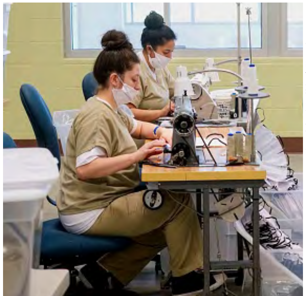
Incarcerated workers sew protective masks at Las Colinas Women's Detention Facility in Santee, California, on April 22, 2020.

Incarcerated workers labored during the pandemic under the threat of punishment if they refused their work assignments. For instance, incarcerated workers in Colorado who opted out of kitchen work assignments in 2020 due to health concerns lost "earned time," meaning their parole eligibility dates were pushed later.686 Workers who