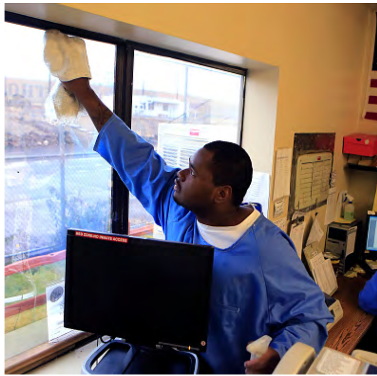
An incarcerated janitor cleans windows in an office at the California Correctional Center in Susanville, California.

From the moment they enter the prison gates, they lose the right to refuse to work. This is because the 13th Amendment to the United States Constitution, which generally protects against slavery and involuntary servitude, explicitly excludes from its reach those held in confinement due to a criminal conviction.<sup>1</sup> More than 76 percent of incarcerated workers report that they are required to work or face additional punishment such as solitary confinement, denial of opportunities to reduce their sentence, and loss of family visitation, or the inability to pay for basic life necessities like bath soap.<sup>2</sup> They have no right to choose what type of work they do and are subject to arbitrary, discriminatory, and punitive decisions