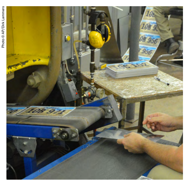
An incarcerated worker working in the Pheasantland Industries license plate shop catches a plate coming off the production line in the South Dakota Penitentiary in Sioux Falls, South Dakota.

Apart from correctional industries, state and local governments also rely on unpaid and lowpaid incarcerated workers for a variety of public