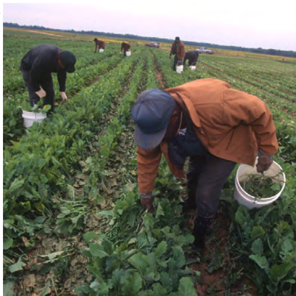
Workers incarcerated at North Carolina's Roanoke River Correctional Institution, located on the site of the former Caledonia plantation, harvest crops on a prison farm outside of Tillery, North Carolina.

five prisons unpaid, with no limit to their daily hours, and without scheduled, guaranteed breaks.<sup>297</sup> Many of these workers are assigned to field work on the "hoe squad," digging ditches, pulling weeds, clearing land, and picking crops while watched by correctional officers on horseback.<sup>298</sup> Incarcerated workers receive no pay for their work, which generates millions of dollars per year for the state. In fiscal year 2019, revenue from sales of the crops and livestock produced by incarcerated workers in Arkansas to outside vendors totaled more than $4.4 million (down from almost $7 million the year before), and incarcerated workers generated an additional $7.5 million in food consumed by incarcerated people that year.299