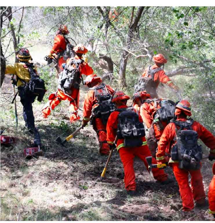
Incarcerated firefighters from the California Department of Corrections and Rehabilitation, Fresno Kings Unit, Miramonte Camp, at a training site in Friant, California.

The main U.S. federal statute that sets minimum standards and safeguards for health and safety in the workplace, the Occupational Safety and Health Act (OSHA), excludes most incarcerated workers—namely, those who work in state correctional facilities—from its coverage.<sup>524</sup> Moreover, many health and safety workplace statutes at the state level do the same, resulting in gaps in protections for most incarcerated workers.<sup>525</sup> Other federal statutes, such