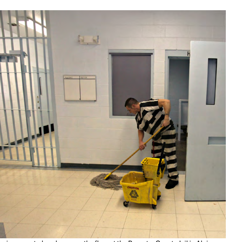
An incarcerated worker mops the floor at the Brewster County Jail in Alpine, Texas.

The International Labour Organization (ILO) Forced Labour Convention, 1930 (No. 29) requires states parties to "suppress the use of forced or compulsory labor" and defines forced or compulsory labor as "all work or service which is exacted from any person under the menace of any penalty and for which the said person has not offered himself voluntarily." However, the Convention excludes the labor exacted from any person as a consequence of a conviction in a court of law, provided that their work "is carried out under the supervision and control of a public authority" and that the person "is not hired to or placed at the disposal of private individuals, companies or associations."819 The Convention does protect prisoners in privately run prisons or when private entities employ or control prison labor.820