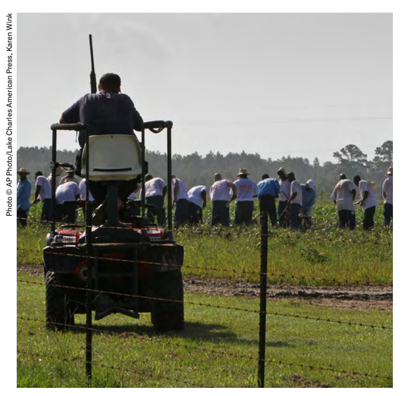
Corrections officers oversee incarcerated agricultural workers working in the fields at C. Paul Phelps Correctional Center in DeQuincy, Louisiana.

In states such as Arkansas, Florida, Georgia, Kentucky, Louisiana, Mississippi, North Carolina, and Texas, incarcerated workers work on penal plantations or prison farms, discussed in more detail in the next section of this report. Incarcerated workers are also employed in agricultural work through prison industries programs in states including Arizona, California, Colorado, Florida,