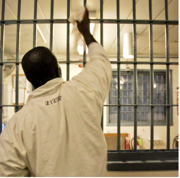
An incarcerated worker cleans bars at a guard station at Tucker Prison near Tucker, Arkansas.

In addition to working under coercive and arbitrary conditions, incarcerated workers in U.S. prisons are often working for paltry wages or no wages at all. Alabama, Arkansas, Florida, Georgia, Mississippi, South Carolina, and Texas pay zero compensation to incarcerated people for the vast majority of work assignments. For instance, in Texas, only the approximately 80 workers employed by private companies through the PIECP program are paid a wage,<sup>469</sup> while the rest of the state's incarcerated workers—121,167 workers as of April 2019—are not paid.<sup>470</sup> Even workers in Texas's state correctional industries program—which reported more than